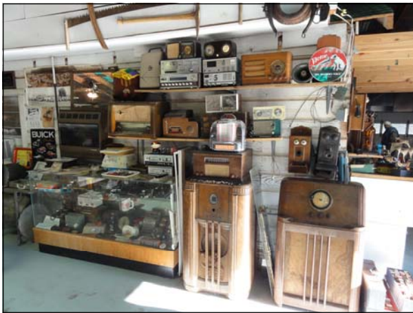
A small portion of Cecil's eclectic collection.